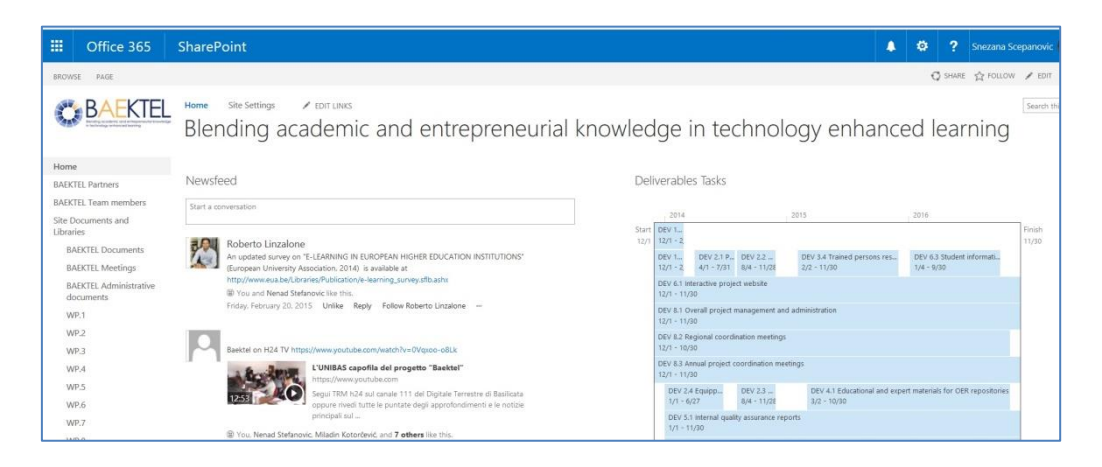
Figure 3: BAEKTEL project management tool - https://rgfrs.sharepoint.com/sites/baektel/SitePages/Home.aspx

BAEKTEL SP (<a href="https://rgfrs.sharepoint.com/sites/baektel/SitePages/Home.aspx">https://rgfrs.sharepoint.com/sites/baektel/SitePages/Home.aspx</a>) platform is customized version of Microsoft SP created according to needs of BAEKTEL project team.