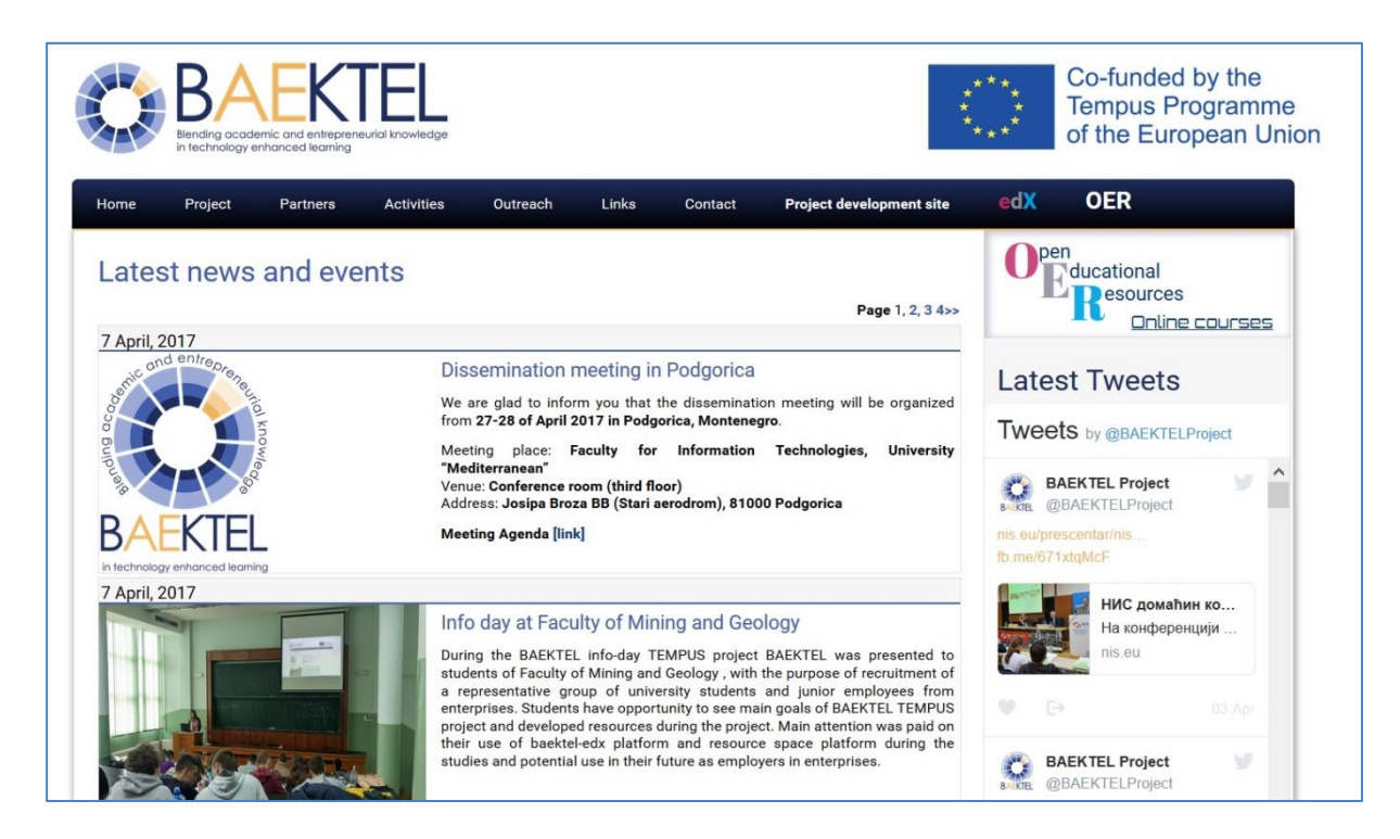
Figure 1: BAEKTEL website (http.baektel.eu)

Attractive BAEKTEL website (http.baektel.eu) has been established at the start of the project in February 2014. During project lifetime BAEKTEL website is constantly updated with all relevant information about project activities, news as well as important links.